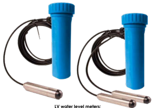
LV water level meters; available for use with 1 or 2 sensors